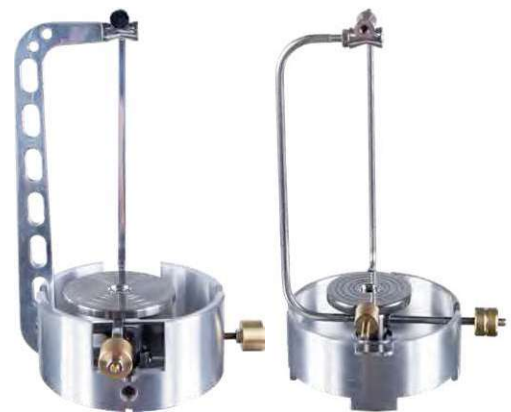
Suspended Self-Centring Weighing Pan for WAY Manual Mass Comparator