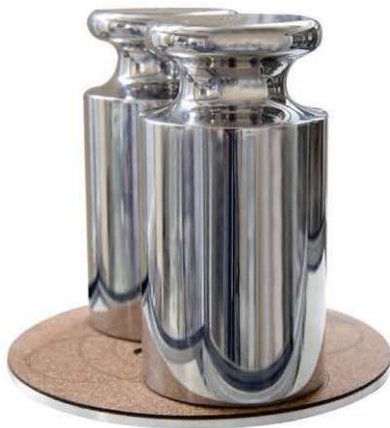
Self-Centering Pan for APP KO Comparator