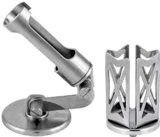
Laboratory ware holders