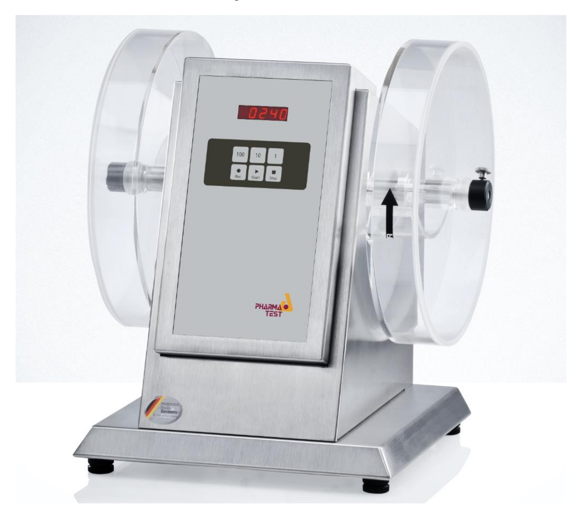
PTF 20E double-drum Tablet Friability Test Instrument

The PTF 20E is a double-drum tablet friability test instrument with fixed speed is manufactured in compliance to the USP <1216>, EP <2.9.7> and other Pharmacopoeias. This version is available as single or dual drum instrument.