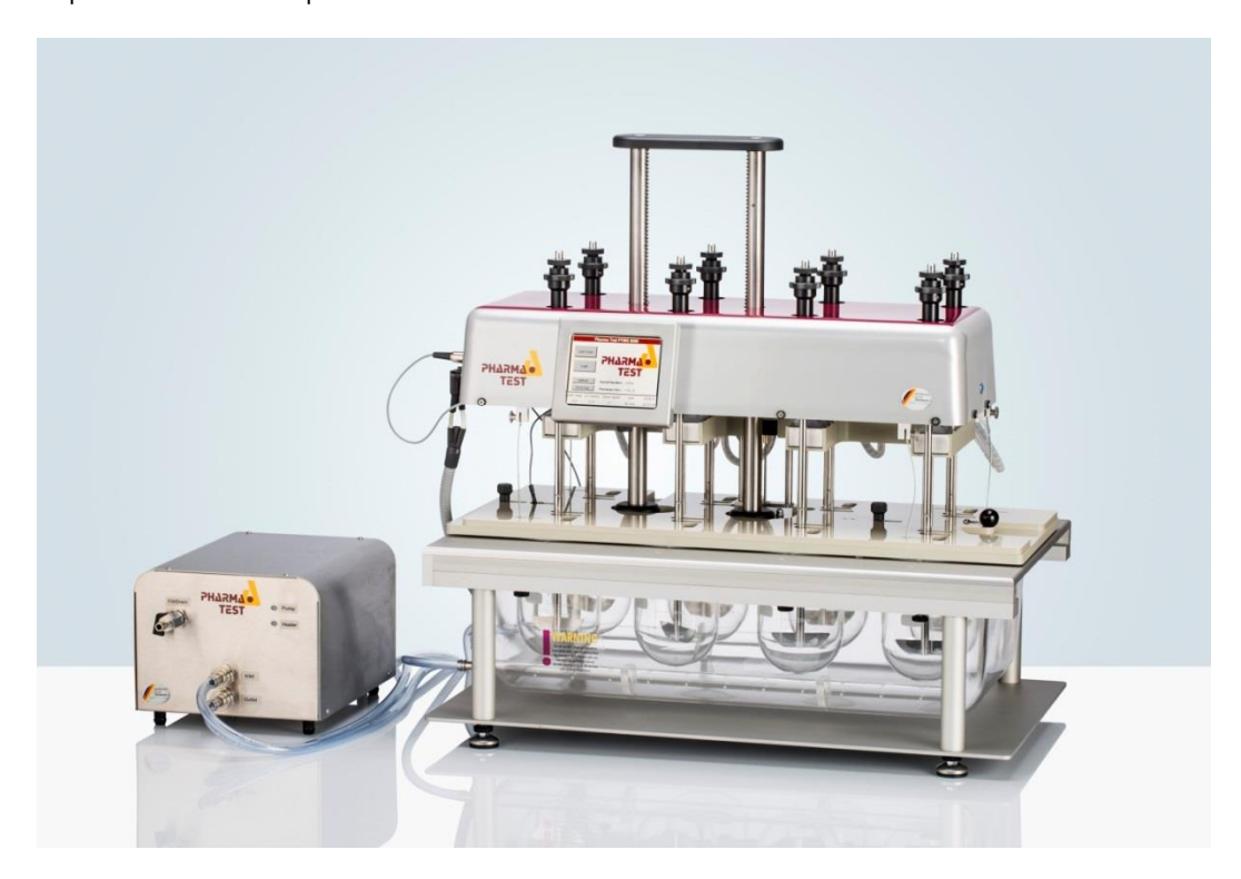
PTWS 820D 8-position Dissolution Tester

The PTWS 820D is an 8 position, single drive compact tablet dissolution testing instrument for solid dosage forms as described in USP chapter <711/724> and EP section<2.9.3/4> as well as the DAB and Japanese Pharmacopeia section <15>.