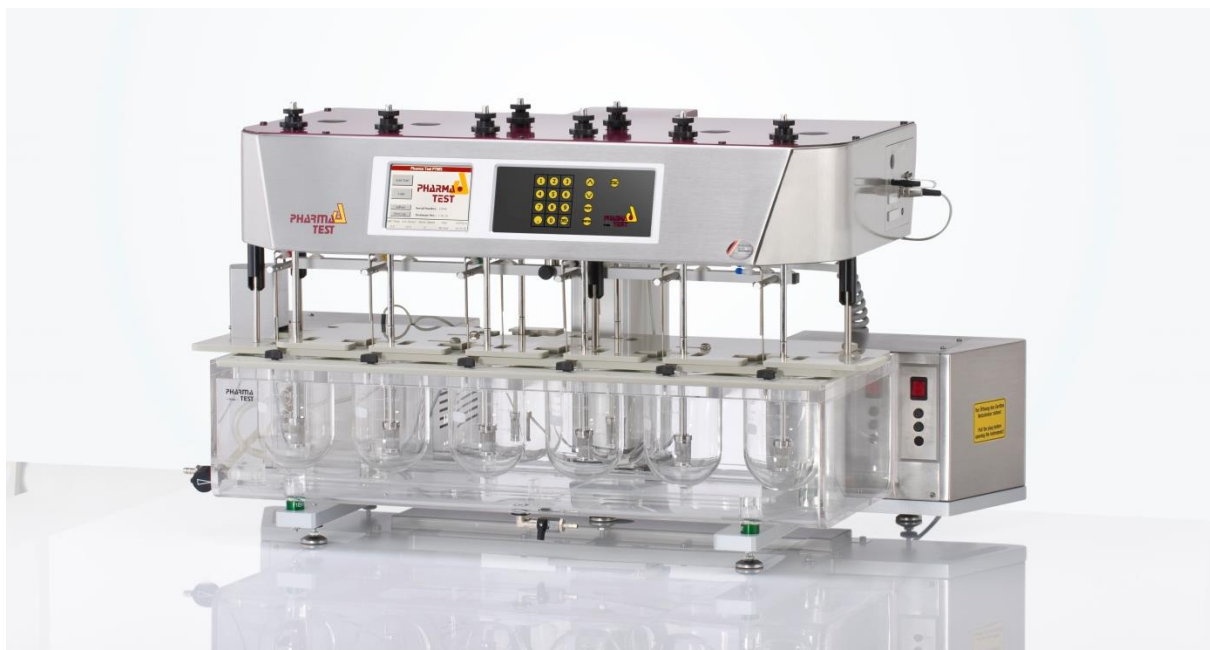
PTWS 620 6 + 2 position, single drive Dissolution Tester

The PTWS 620 is a 6 + 2 position, single drive tablet dissolution testing instrument for solid dosage forms as described in USP chapter <711/724> and EP section <2.9.3/4> as well as the DAB/BP and Japanese Pharmacopeia section <15>. The USP monograph <1092/2.4.2> lists visual observation of the dissolution behavior as essential for identifying variables in the formulation or manufacturing process. The six vessels in the front row of PTWS 620 offer optimal visibility of the samples.