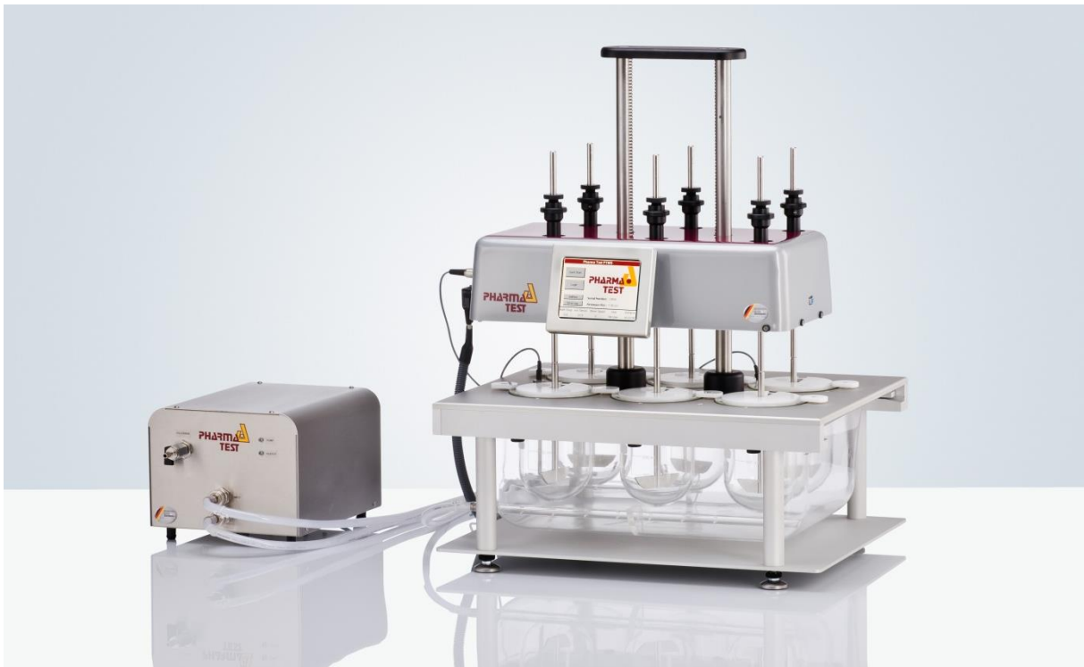
PTWS 120D 6-position Dissolution Tester

The PTWS 120D is a 6 position, single drive, compact tablet dissolution testing instrument for solid dosage forms as described in USP chapter <711/724> and EP section <2.9.3/4> as well as the BP, DAB and Japanese Pharmacopeia section <15>. It is designed for manual operation and ease of use.