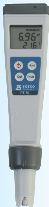
PH/TEMP. TESTER PT-70 WITH REPLACEABLE ELECTRODE