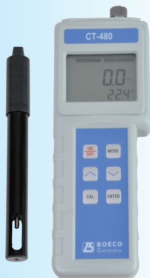
BOECO PORTABLE CONDUCTIVITY/ TDS/SALINITY/TEMP METER MODEL CT-480