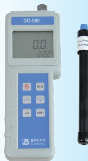
BOECO PORTABLE DO/TEMP METER MODEL DO-580