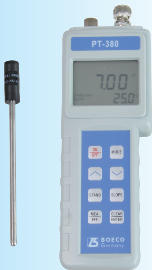
BOECO PORTABLE PH/ ORP/TEMP METER MODEL PT-380